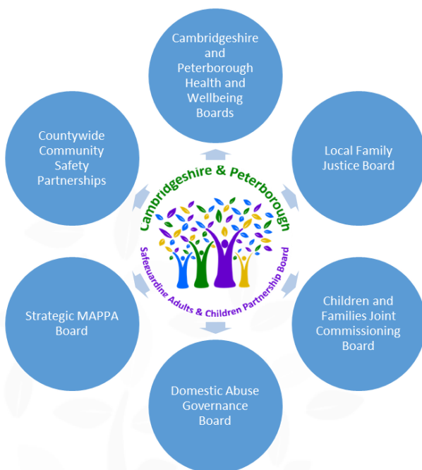
IMAGE 1 - LINKS TO OTHER STATUTORY BOARDS

The Executive Safeguarding Partnership Board has maintained its links with other groups and boards who impact on child and adult services this year. These are illustrated in Figure 1. This ensures that all aspects of safeguarding are taken into account by the other statutory boards and there is a co-ordinated and consistent approach. These links mean that safeguarding vulnerable people remains on the agenda across the statutory and strategic partnership and is a continuing consideration for all members.