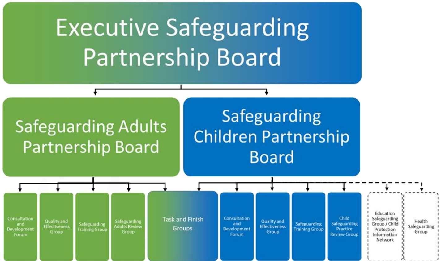
IMAGE 2 - DIAGRAM SHOWING THE STRUCTURE OF THE CAMBRIDGESHIRE AND PETERBOROUGH SAFEGUARDING PARTNERSHIP BOARD

The work of the various Boards and groups within the governance arrangements is overseen by the Independent Safeguarding Partnership Service. The service is managed by the Head of Service and includes roles that cover both adults and children’s agendas. Some of the roles are specialised in quality assurance and improvement, exploitation, training, communication and there are more general adult and children’s leads and dedicated administrative roles. The service ensures that there is robust, countywide independent scrutiny and oversight of multi-agency practice.